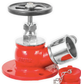
Single Headed Fire Hydrant ...