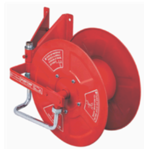
Fire Hose Reel Drum