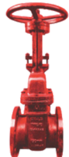
Sluice Valve Rising Spindle