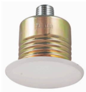
Forged Brass Sprinkler Conc...