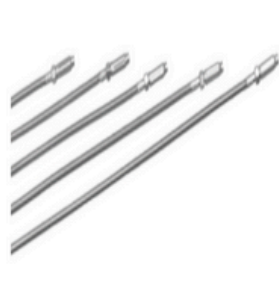
SS Flexible Hose Unbraided