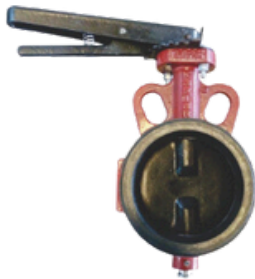
Butterfly Valve Aqualine