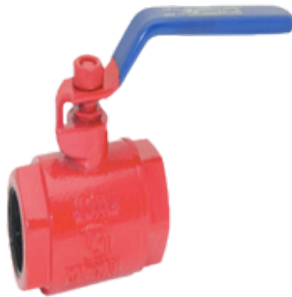
Cast Iron Ball Valve Screwed