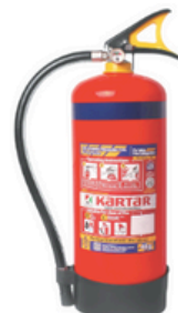
Fire Extinguisher (BC Powde...