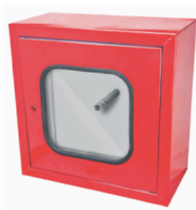
Hose Box (Single Door) 15m...