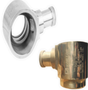
Spare Coupling SS & GM