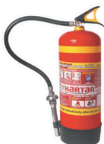
Foam Type Fire Extinguisher...