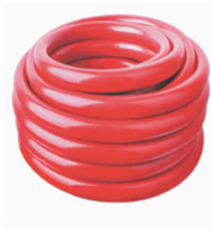
Thermoplast Hose pipe