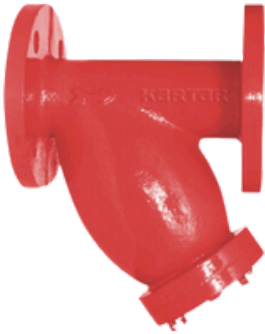
'Y' Type Strainer