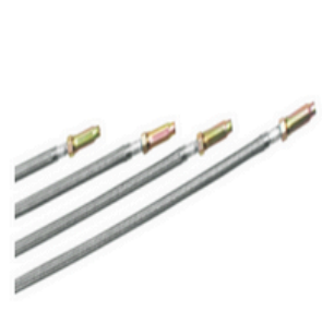
SS Flexible Hose braided