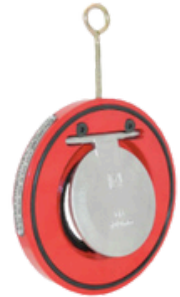
Check Valve Single Plate