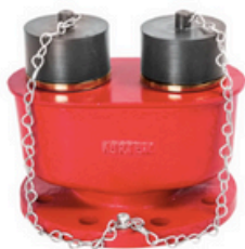
2 Way Inlet | 3 Way Inlet | 4...