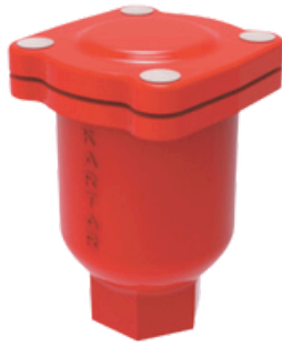
DI Single Chamber Air Valve