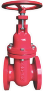
Extra Strong Sluice Valve N...