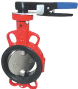
Butterfly Valve K Line