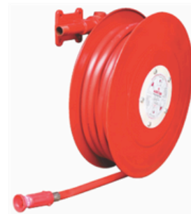
Malaysian Type Hose reel d...