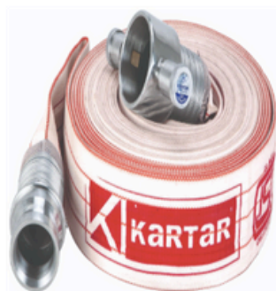
CP Hose ( Controlled percol...