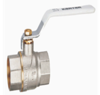
Forged Brass Chrome Plate...