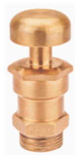
Air Release Valve