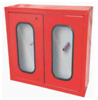
Hose Box (Double Door)