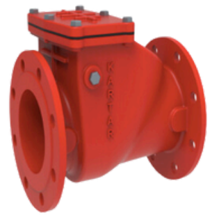
Non Return Valve