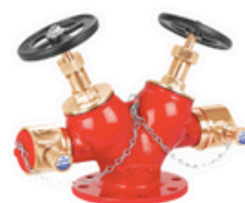
Double Landing Valve