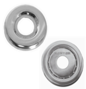
Sprinkler Rosette Plate | Fi...