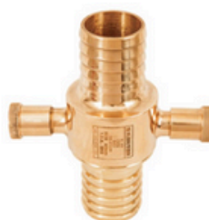
Fire Hose Coupling / Connec...