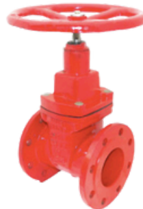
Resilient Seated Gate Valve