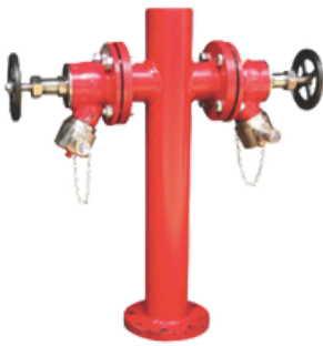
MS Fabricated Stand Post