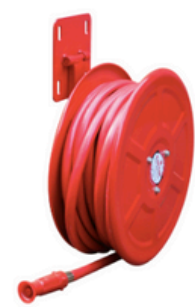
Fire Hose Reel Drum ( Comp...