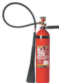
CO2 Type Fire Extinguisher