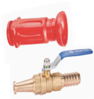
Shut Off Nozzle PVC & Brass