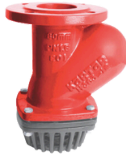
DI Ball Type Foot Valve