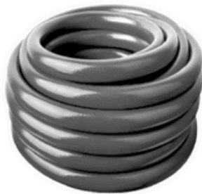
Rubber Hose Pipe