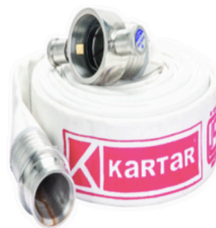
RRL ( Reinforced Rubber Lin...