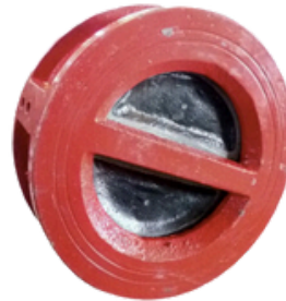
Check Valve Dual Plate